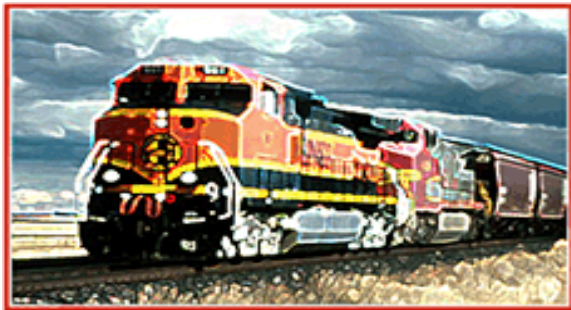
Nationwide Railway Connections